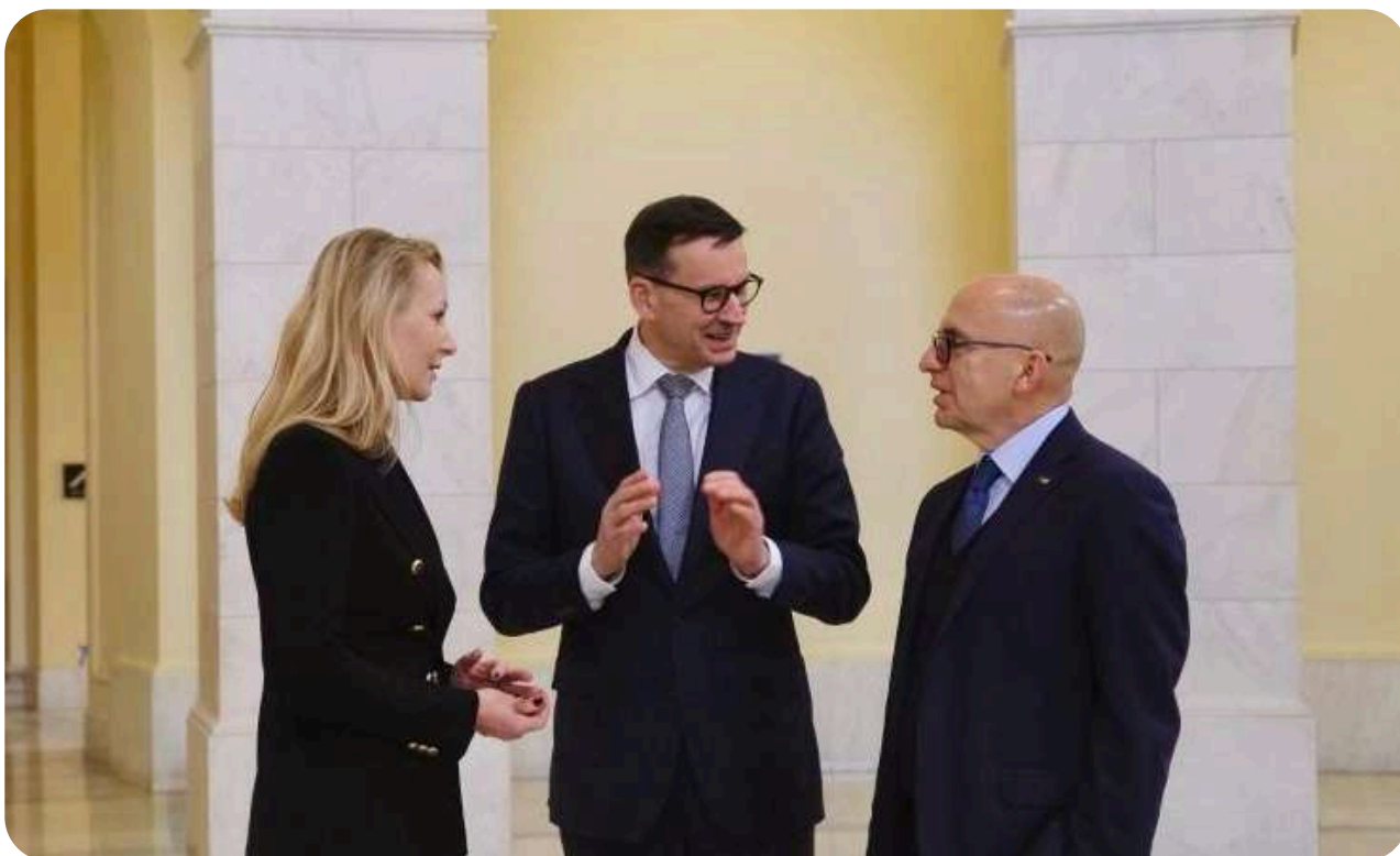
4. Presidential Inauguration (POTUS), January 2025 Representation of the ECR Party, together with Vice-Presidents and the Secretary General, during the inauguration ceremonies in the United States